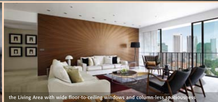
the Living Area with wide floor-to-ceiling windows and column-less spaciousness