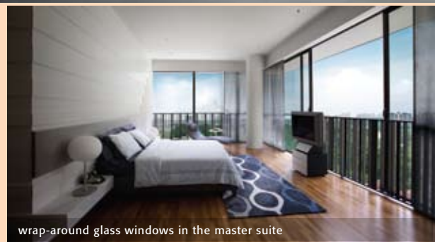
wrap-around glass windows in the master suite