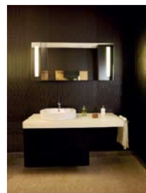
Sonic by Leonard Theosabrata