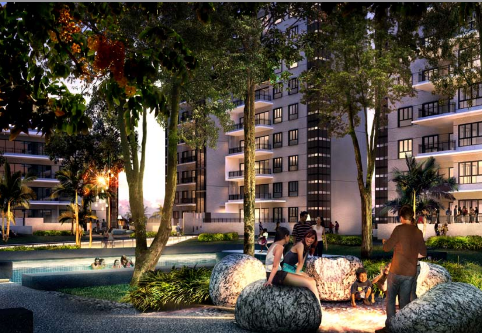
The Garden - extension with shaded canopy walk of Angsana trees, illuminating sculptural

Much more than a lifestyle, Five Stones is about a way of life and a standard of living that defies the prevailing development mindsets and practices. It is poised to set a whole new standard of community living in Petaling Jaya.