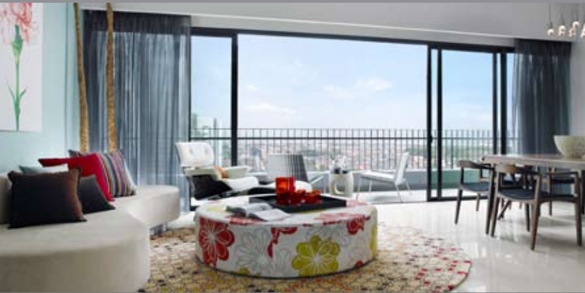
the spacious living & dining which extends into a 25-foot wide balcony