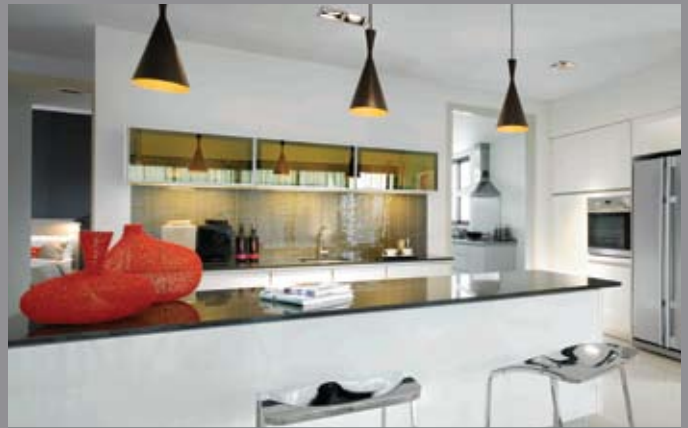
well-appointed designer kitchen with appliances