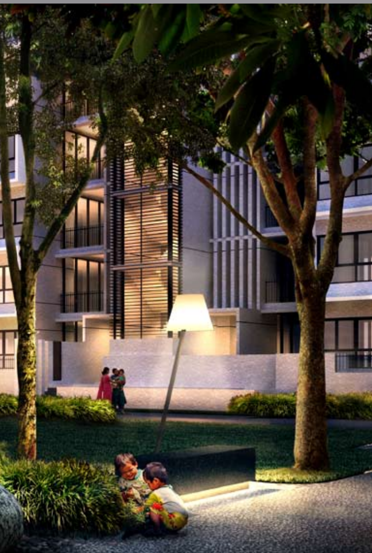
Expanding your world beyond your four walls in a half-acre outdoor space with lush greenery and imaginative lighting themes that create a magical ambience