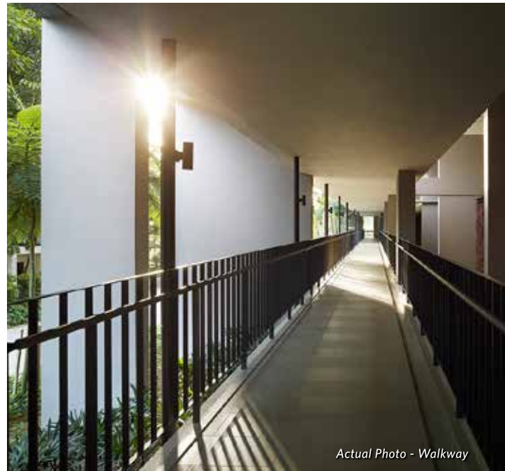
Actual Photo - Walkway

We are pleased to inform that Five Stones was recognised by Persatuan Arkitek Malaysia (PAM) and was awarded Silver in the Multiple High-Rise Category