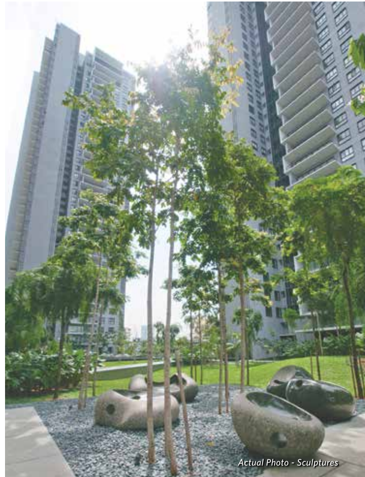
Actual Photo - Sculptures