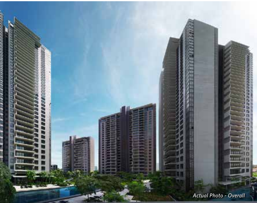
Actual Photo - Overall