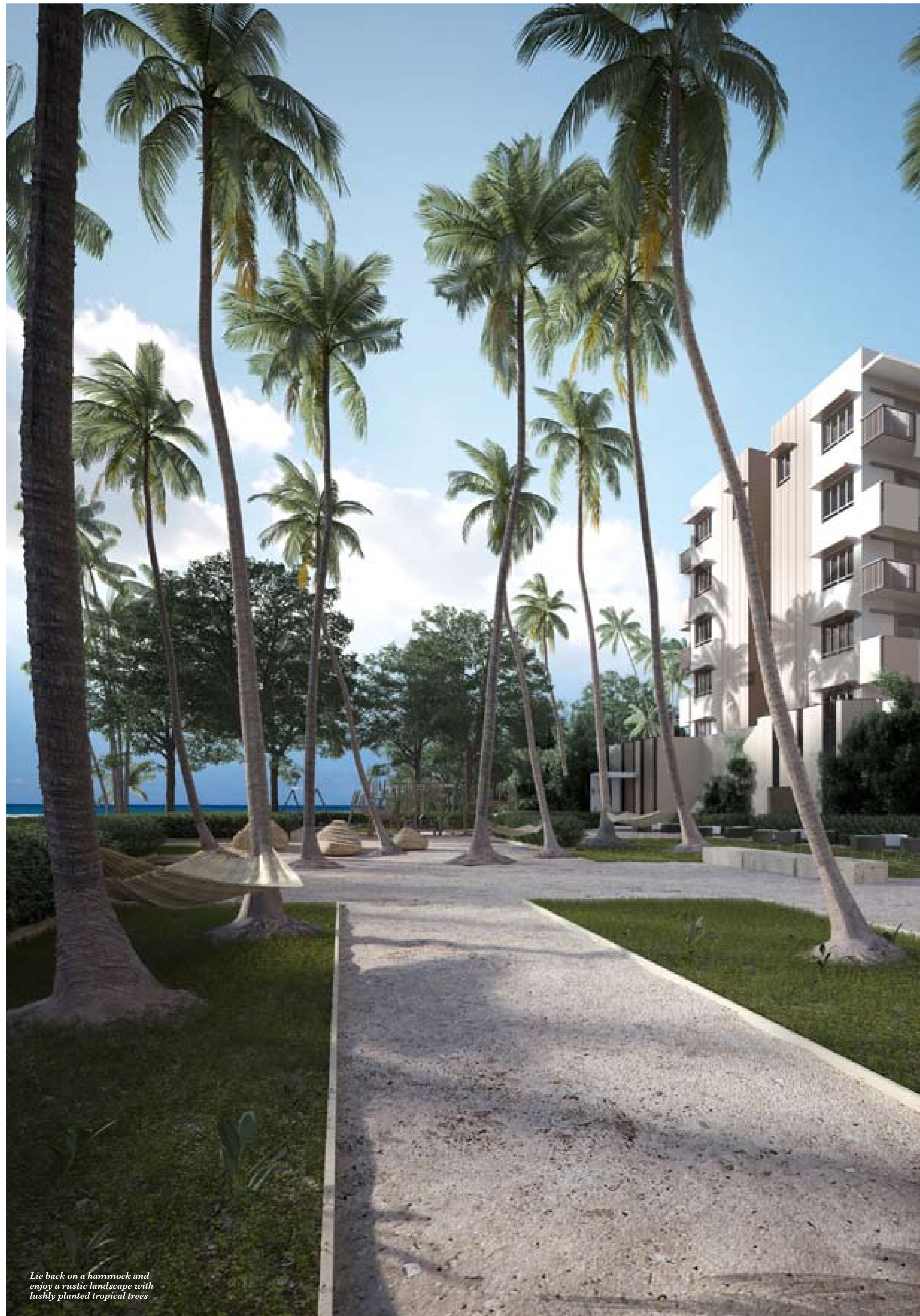
Lie back on a hammock and enjoy a rustic landscape with lushly planted tropical trees