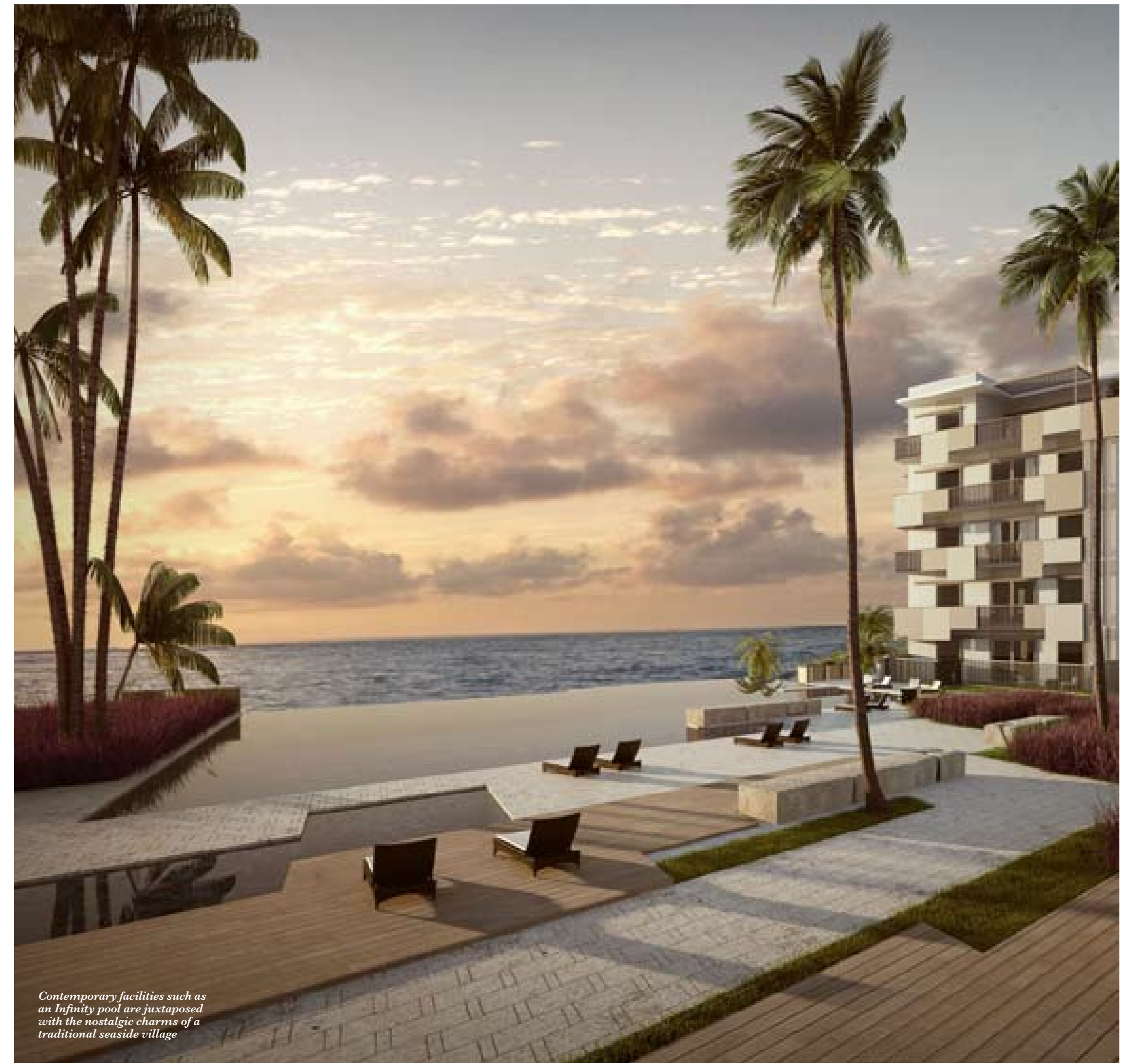
Contemporary facilities such as an infinity pool are juxtaposed with the nostalgic charms of a traditional seaside village