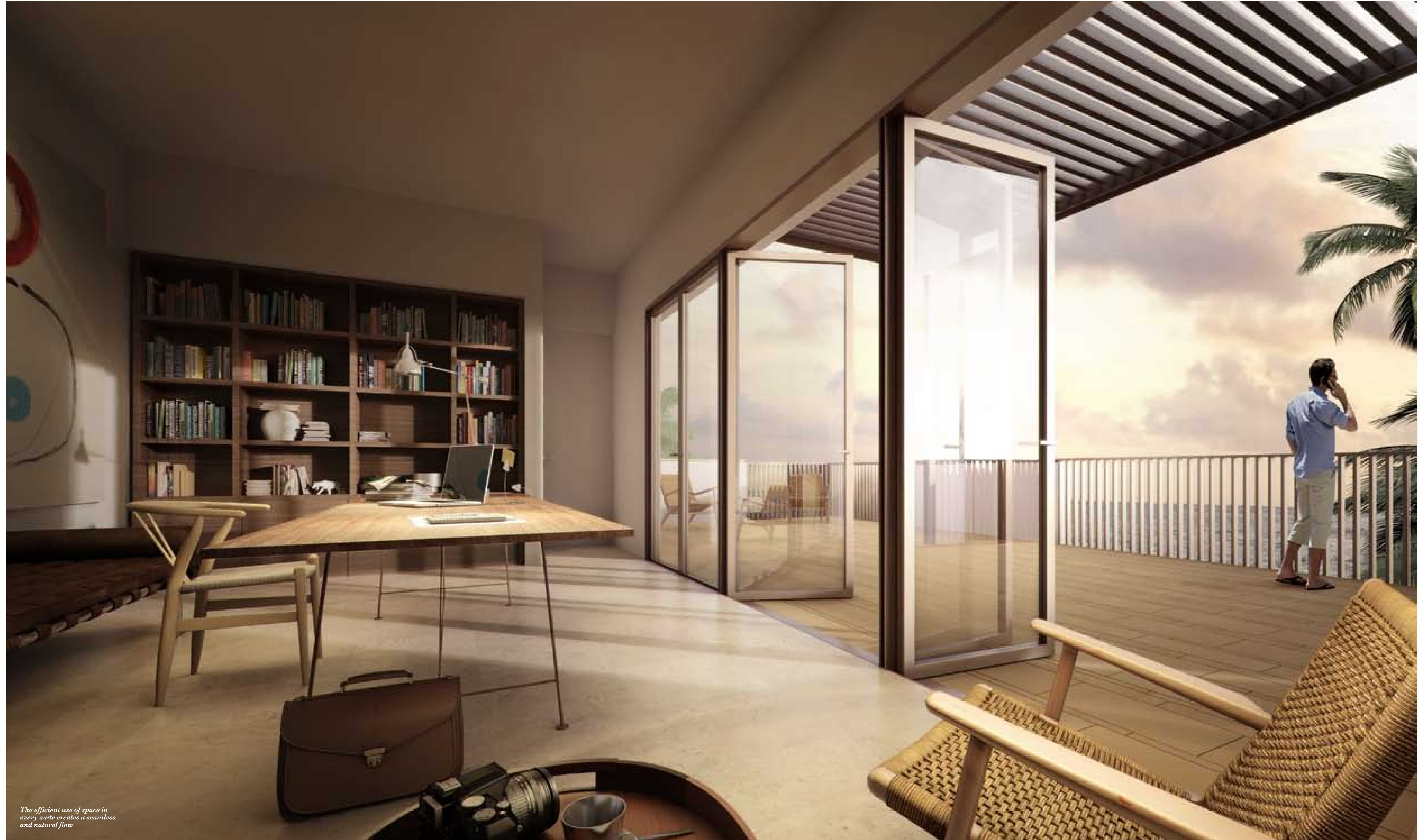
The efficient use of space in every suite creates a seamless and natural flow

In the 18 limited edition Executive suites, the distinct pleasure of a roof terrace is all yours. In selected Podium suites, you can even walk directly from your terrace onto the pool deck. And throughout this unique low density development, you enjoy the exclusivity and rare privacy made possible only by having not more than 4 suites per floor. There is also the assurance of enhanced security enabled by a card access system.